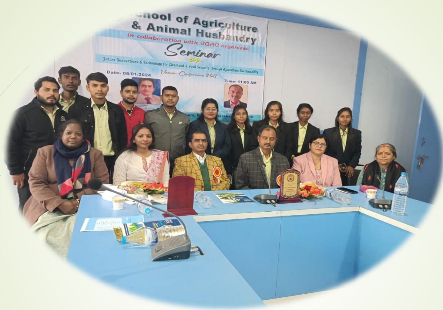
Group photo with our Chief Guest, Faculties of the YBN University and their students